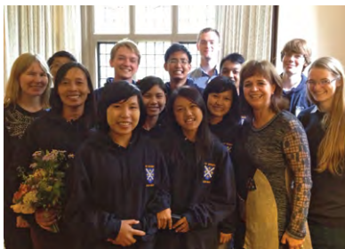
The pupils on their final day at College with the Principal, their teacher and some of the programme's volunteers.