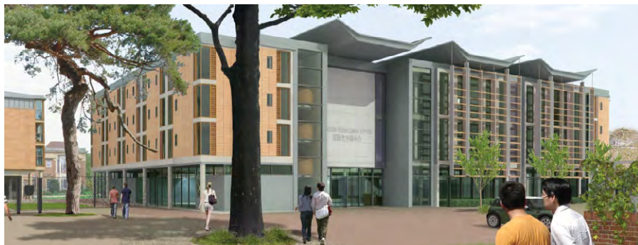
Architect's impression of the Dickson Poon China Centre Building.

All Senior Members who made gifts of £1,000 or more to this project before 15 February 2014 will have their names recorded on a donor board in the building's dining room, which will be called 'The Wordsworth Tea Room'. The names of 79 Senior Members currently appear on this board, to be unveiled when the building is formally opened in September 2014.