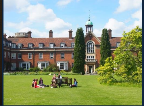
Images (L-R): The Howard Piper Library; the Koran, the first book in the College library; a tutorial on the lawn in front of the Main Building.