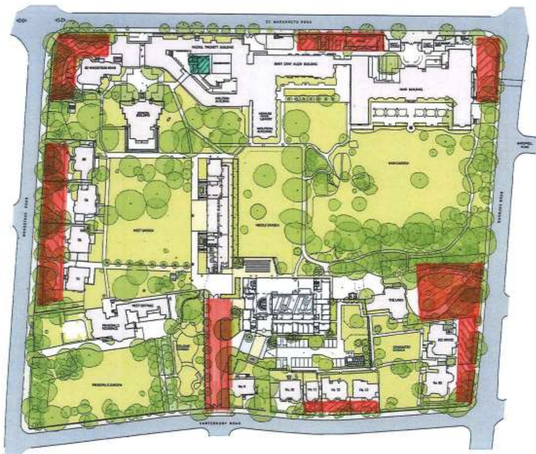
Map of St Hugh's College, showing designated smoking areas (in red).