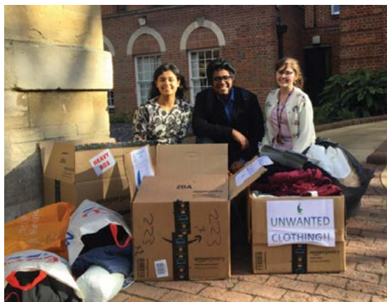
The results of our charity clothes donation in Trinity 2018.

2017-18 was an eventful year for the Middle Common Room. From charity auctions to barbeques our graduates have enjoyed the vibrant social life and facilities which our MCR offers.