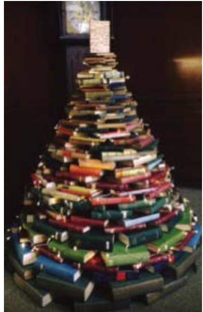
Note that no books were harmed in the making of this tree.