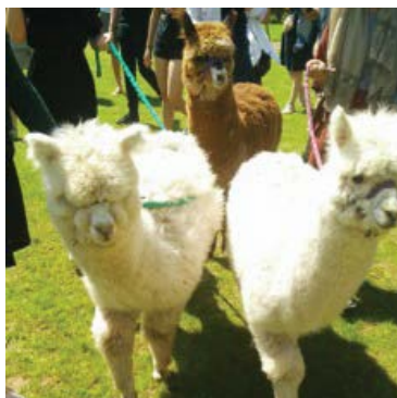
The 'Alpocalypse' begins.