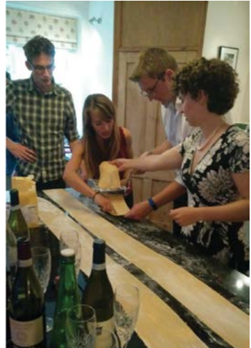
MCR members enjoy Formal Hall.