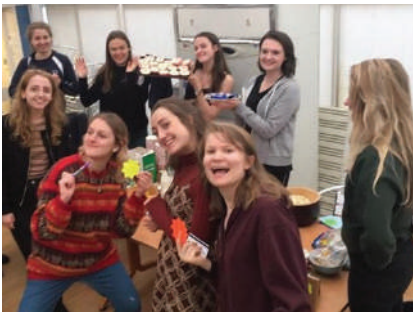
The Women's Welfare Tea

2017 is also the year we launched the newly redesigned JCR website after many years. This can be viewed online at http://jcr.st-hughs.ox.ac.uk/ and allows us to share information and exciting updates. Prospective and current students can peruse the minutes of previous JCR meetings, find out about the roles of the JCR Committee and find an up to date version of St Hugh's societies and who to contact to get involved. The updated website has helped to increase interest in the JCR, and this, along with