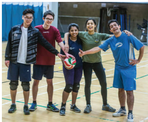
The St Hugh's Volleyball Team Semi-finalists

A new Entz initiative will hopefully help foster an even stronger sense of community; a 'St Hugh's Photos' group, made up of any aspiring photographers within College, will be present to photograph JCR members at JCR events. Highlights of the JCR calendar include the ever-popular weekly formals, the lawn party with a bouncy castle and burgers and the much-loved Easter Egg Hunt around the College grounds.