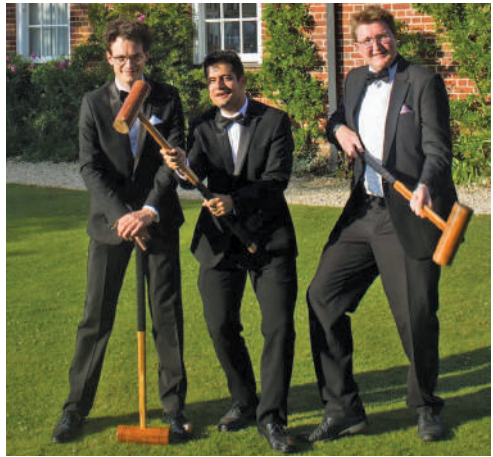
The St Hugh's MCR Croquet Team.