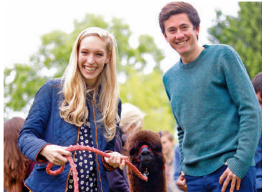
Happy Hughsies enjoying a visit from alpacas before exams in Trinity Term.

The most prominent collaboration between our common rooms was the welfare event featuring four halter-trained alpacas who visited St Hugh's in Trinity Term. MCR and JCR members embraced the opportunity to walk the animals around college grounds, and take an exciting break from studying for their exams. The success of this event followed two previous welfare events aimed at supporting the LGBTQ+ community in St Hugh's. 2017 was the first year that the MCR and JCR worked together to promote inclusive, fun evenings for all LGBTQ+ students and allies, including an array of rainbow-coloured drinks and snacks.