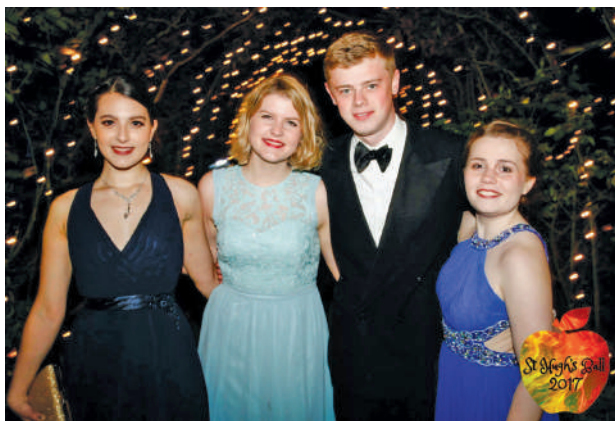
St Hugh's students enjoying the ball