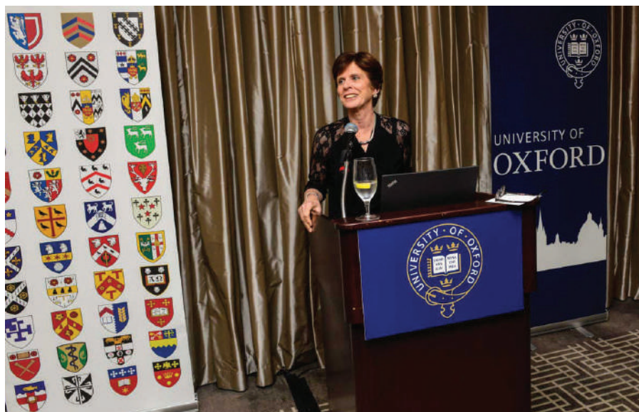
Vice Chancellor Professor Louise Richardson.

The St Hugh's College North American Alumni Association was launched in 2017. The Association's Committee includes representatives from New York, Washington DC, Boston, Los Angeles, and San Francisco and the last year has seen events in each of those locations, including holiday gatherings in New York and Washington. We are eager to add representation from other major US cities, Canada and Mexico.