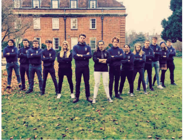
The 2017 JCR Committee

2017 saw a change to the JCR Committee with a vote to create a new Committee position, that of Careers Rep, in March 2017. The Careers Rep will work closely with the St Hugh's Development Office and the University-wide Careers Office to inform students of various career opportunities available to them and the paths alumni have taken since graduating from St Hugh's. We are proud to be one of the first Oxford colleges to take this step. The Welfare and Equal Opportunities (WEQ) Committee, following a recent revival, has also seen new representatives with fresh ideas taking over.