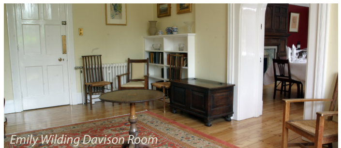
Emily Wilding Davison Room