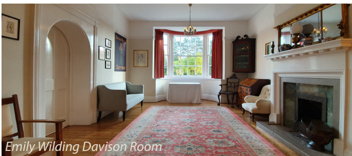
Emily Wilding Davison Room