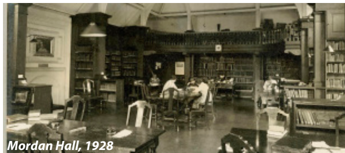
Mordan Hall, 1928