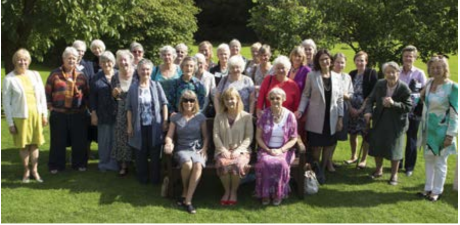
1966 Jubilee Lunch group