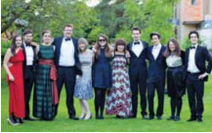
Excited Hughsies on the MCR lawn in readiness for Kellogg Ball