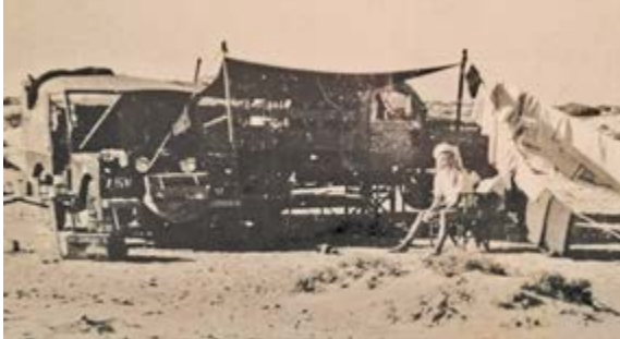
Drying the laundry! In the sand dunes on the Red Sea coast of Eritrea, 1956

In 1950 I was offered a job as cartographer at the Survey in Nairobi. It was tempting, but having reached the dizzy height of Experimental Officer, researching the seasonal movements of the Desert Locust in SW Asia, I decided to stay in London to finish the work. However, in 1951 another vacancy came up at the Survey, and I was soon on