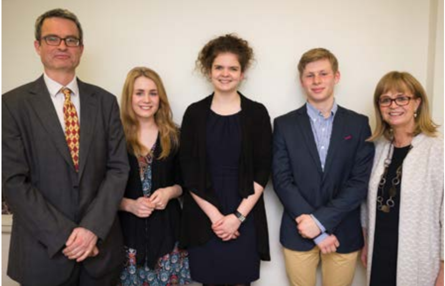
The Principal with winners of the Mary Renault Essay Prizes, at the event in April 2016

Over 120 guests and alumni joined us for what was a very enlightening look at her work within the wider context of Classics. During June and July, we held our traditional Afternoon Tea for Donors and our summer Garden Party, which included the Alumni Association's AGM, where we were joined by over 200 alumni.