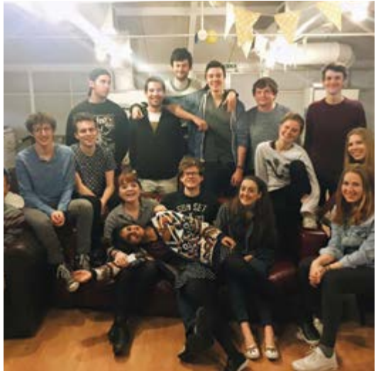
JCR Committee 2015-16

It is telling that ideas of genesis are evoked when major change occurs. The execution of Charles I brought with it seemingly radical ideas of equality and liberty, derived from what was believed in scripture to be the very beginning of mankind itself. For the JCR, change brought with it a push to reassert the College's founding ideology; that first class higher education should be provided for all students regardless of their background. This year the JCR has, as always, seen a new committee bringing with it fresh ideas about how to make the undergraduate community a happier and more inclusive place than ever before.