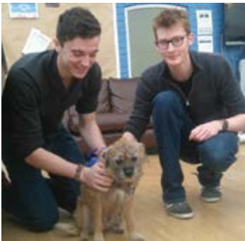
Puppy Therapy with Bebe

But no matter how much we try, fifth week will always be an exhausting point. Over the 'welfare weeks', JCR members had the chance to let their hair down with various activities from yoga sessions, puppy therapy, face masks, to a sleep workshop