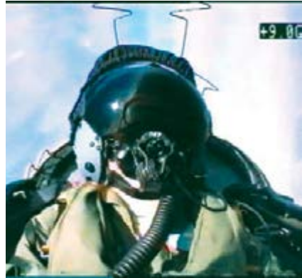
Pulling 9G in RAF SAM Hawk