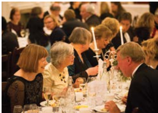
St Hugh's donors at the annual Donors' Dinner in March 2016