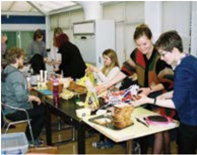
The Gatehouse Sandwich Club

by the working group received praise in the University Assessor's Report for Race Equality 2015-2016 and is expected to continue as we strive to improve experiences of Oxford for those from a variety of backgrounds.