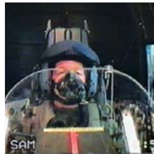
Relaxing at 9G on the Centrifuge