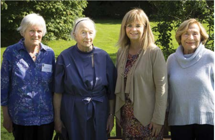
1946 Jubilee Lunch group