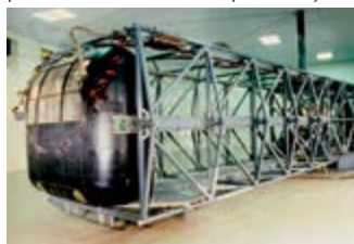
RAF IAM Centrifuge

My next job involved assessing the weapon aiming systems for the Harrier (including two trips to the US for trials) and the Jaguar, again using my analysis skills (together with partial differential equations). This work led to some of the RAE test pilots offering me flights in a number of Fast Jets (FJs) - Hunter, Jaguar, Hawk and Lightning. This gave me a much better understanding of the FJ environment, which was very useful for my job – I experienced low level flying, air-to-air combat, air-to-ground bombing and strafing, aerobatics, formation flying, air-to-air refuelling, instrument approaches and supersonic flight.