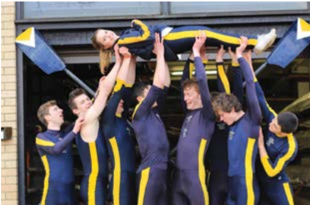
St Hugh's Men's 1st Eight, blade winners in Torpids and Summer Eights

For those who prefer not to use their hips or strain their vocal chords, the sporting societies of St Hugh's continue to offer alternatives, to remarkable success. The Boat Club gained a huge number of new rowers in Michaelmas Term which made for a very successful Torpids in Hilary Term – an unprecedented three crews won blades (by bumping every day); the Men's Second Boat moved up four places, Men's First Boat five places and Women's First Boat six places. Summer Vllls saw the Men's First Boat continue their success as they again achieved blades by bumping 5 times and moving up to Division II for the first time in the history of St Hugh's, whilst also being the highest blades winning crew in the whole of Summer Vllls for 2016. The netball club continued their success and status within the college, whilst the football team continued to thrive and build on the success of previous years.