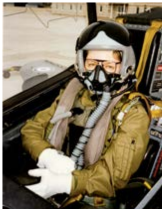
Trialling US Flying Clothing