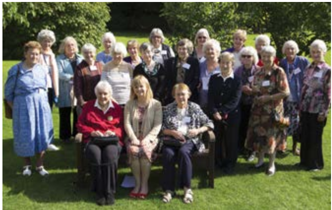
1956 Jubilee Lunch group

in May for an exclusive private view of the 'Pre-Raphaelites on Paper' exhibition at Leighton House Museum, followed by a house tour at this remarkable building. In June, we were fortunate to be hosted by British Museum Deputy Director and alumnus